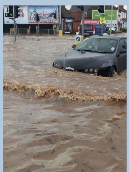
Flooding in Loughborough in June 2012

The rain was so intense that we issued flood warnings in areas suffering from drought. In those areas, groundwater remained depleted and took some time to recover before the temporary use bans could be lifted.