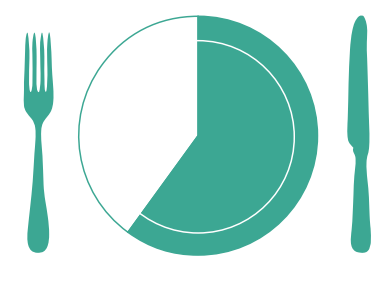
610/0 of nation's food needs are met by British farming

of people think it is important that Britain has a productive and resilient farming industry