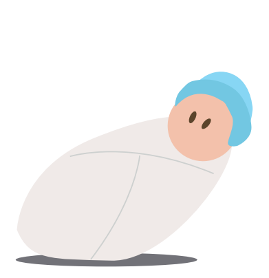
When you were born you were a baby. Your mum was pregnant with you for around 9 months.