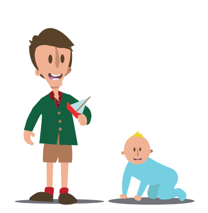
Before you came to school you were a toddler maybe you have a younger brother or sister who is a toddler now?