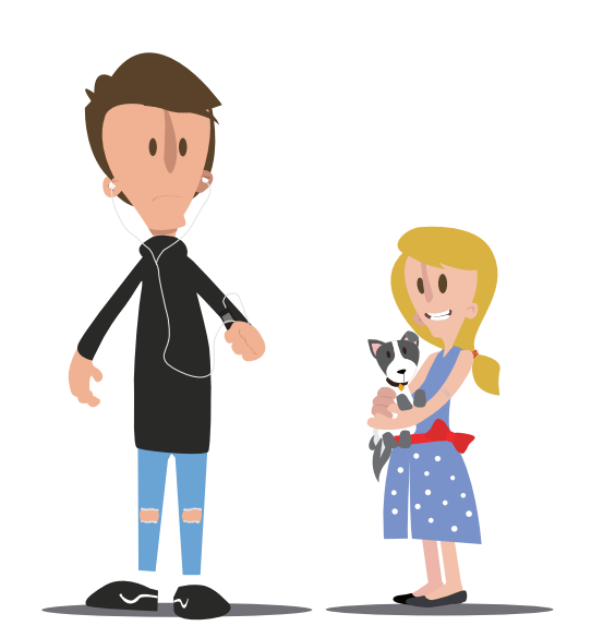
You are now a child maybe you have an older brother or sister who is a teenager?