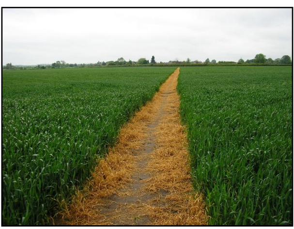
An example of a sprayed path