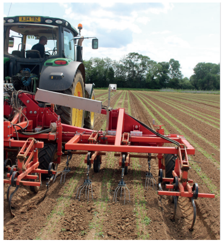
Garford mechanical hoe

The farm uses forecasting tools to be as prepared as possible for pests, such as AHDB Pest Forecast, trapping and field scouting, which ensures that they have an accurate measure of aphid numbers. Generally the farm release additional beneficials before they see aphids to ensure that there will be a spike in predators at the same time as the pests.