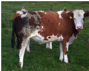
Parasite forecast: Ostertagiosis

This September's Parasite Forecast outlines the parasitic challenge facing cattle and sheep in the different regions of the UK including the provisional 2013/14 liver fluke forecast, lungworm in cattle and parasite gastroenteritis in cattle and sheep, all of which may be problems with rain arriving after the prolonged dry spell. SCOPS best practice recommendations are also highlighted.