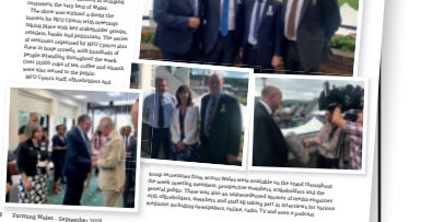
Wales Women Farmer of the Year Awards 2019

The Wales Women Farmer of the Year Awards 2019 are now open for nominations. The awards celebrate the achievements of women in the agricultural sector. Nominations are accepted from all sectors of the industry and will be judged by a panel of experts.